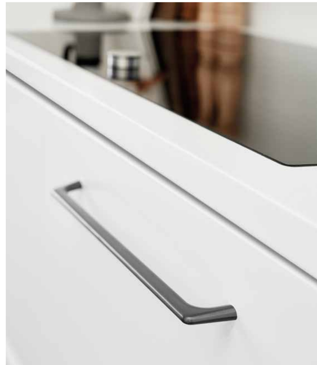
VISTA 538560xxx Centre distance 160 - 320 Length 176 - 336 Width 10 Height 38 Design Kamper Form Material Zamac Finish 91 - Brushed anthracite

76. Brushed matt black This finish is used on handles made of aluminium. The handle is firstly anodised in black, and secondly brushed to create the right surface.