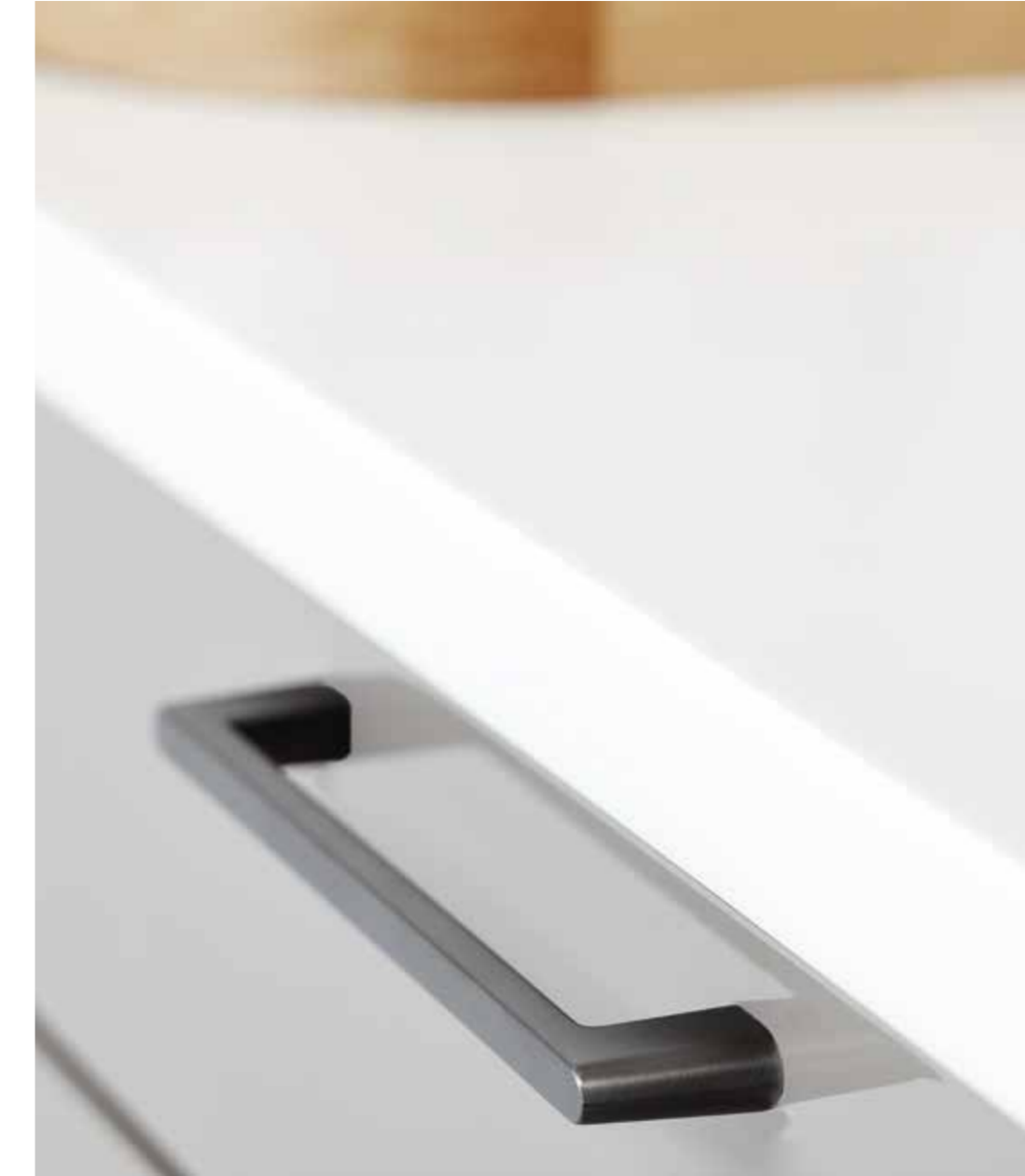
DINER 541360xxx Centre distance 160 - 320 Length 180 - 340 Width 12 Height 30 Diameter - Design Kamper Form Material Zamac Finish 91 - Brushed anthracite

9005. Black This finish is created in two different ways depending on the metal of which the handle is made. If the handle is made of aluminium, the finish is anodised in black. If it is made from Zamac or stainless steel, the finish is created by using a matt black lacquer.