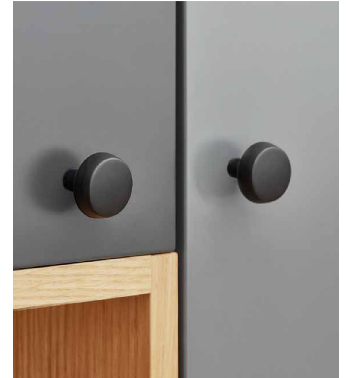
AUTUMN 541060xxx Design VE2 Material Zamac Finish 99 - Matt black Centre distance - Length - Width - Height 27-34 Diameter 28 - 36

Join us on instagram, and be the first to receive the latest news about our designs, contests, videos etc. News are released on instagram before other furnipart channels. Follow us and be inspired through pictures and words.