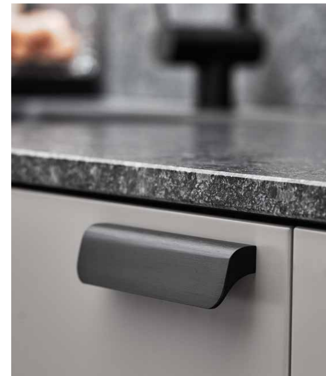
FALL 434320224 Design VE2 Material Aluminium Finish 76 Brushed black Centre distance 16 - 128 - 224 Length 28 - 140 - 236 Width 20 Height 30