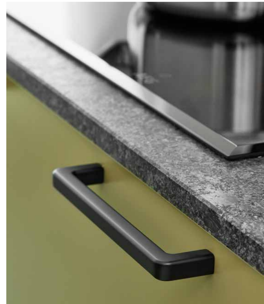
MANGO 529060xxx Centre distance 160 - 192 - 320 Length 172 - 204 - 332 Width 12 Height 35 Design Kamper Form Material Zamac Finish 9005 - Black